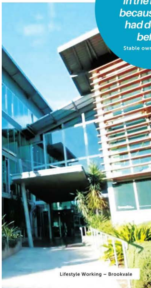
Lifestyle Working – Brookvale

The concept certainly raised eyebrows initially.