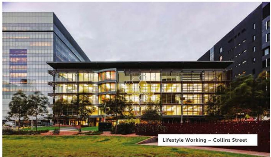
Lifestyle Working - Collins Street

The Green Building Council of Australia crowned Collins Street the first