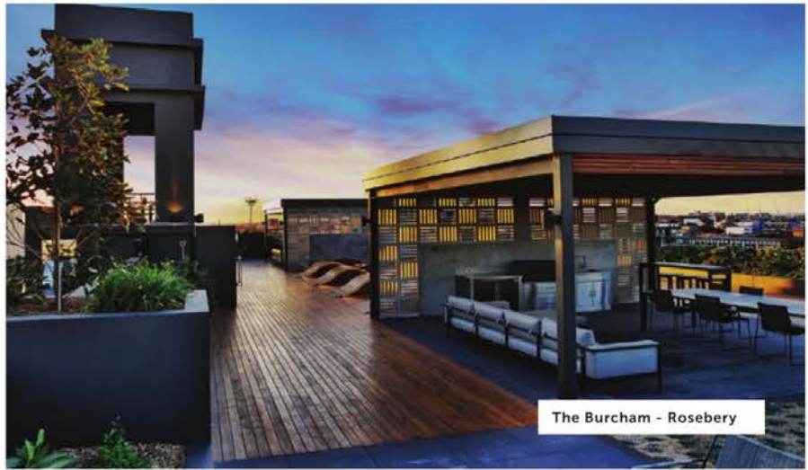
The Burcham - Rosebery